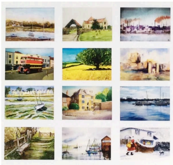
Fareham Art Group Calendar 2017