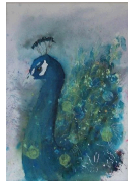
'Proud As A' Mixed Media

I take a weekly walking group which was set up in 2015 which of course always finishes with a tea or coffee!