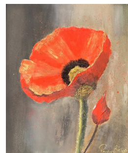
'Just A Poppy' Pan Pastel & Watercolour